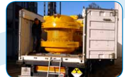
Transport (BU) container for radioisotopes