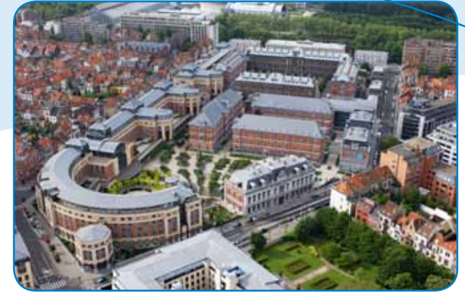
The Royal Military School