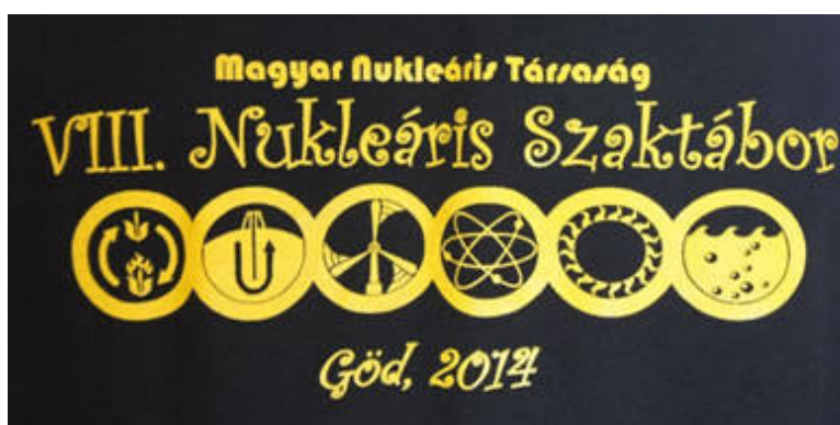
The Hungarian Nuclear Society

http://www.euronuclear.org/e-news/e-news-45/ygn-report.htm