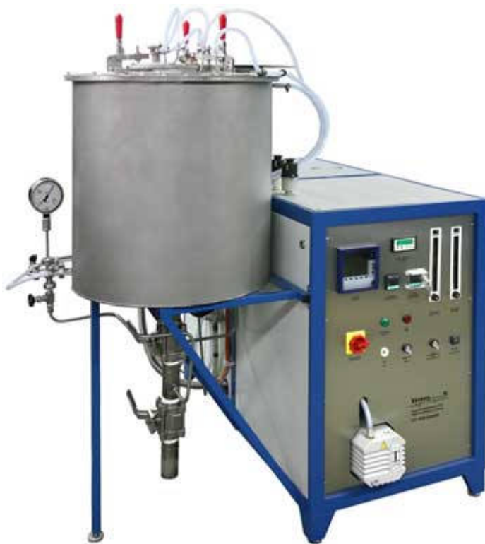
HT 1600 Special

up to 2100 °C, 4 - 52 l. Controlled atmosphere, partial pressure, vacuum, gas re-cooling