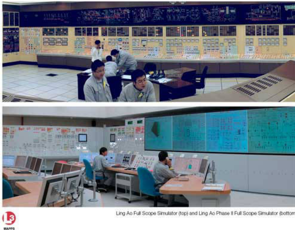
Ling Ao Full Scope Simulator (top) and Ling Ao Phase II Full Scope Simulator (bottom)