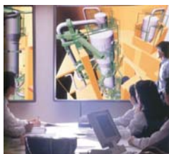
ENGINEERING, DESIGN & EXPERTISE