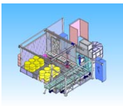
NEW BUILD, REFURBISHMENT & MANUFACTURING