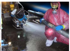
DECOMMISSIONING & WASTE MANAGEMENT

ONET TECHNOLOGIES: 36 Bd de l'océan, CS 20280, 13258 Marseille cedex 09 Phone: +33 4 91 29 18 10 – Fax : +33 4 91 29 18 58 – www.onet-technologies.com