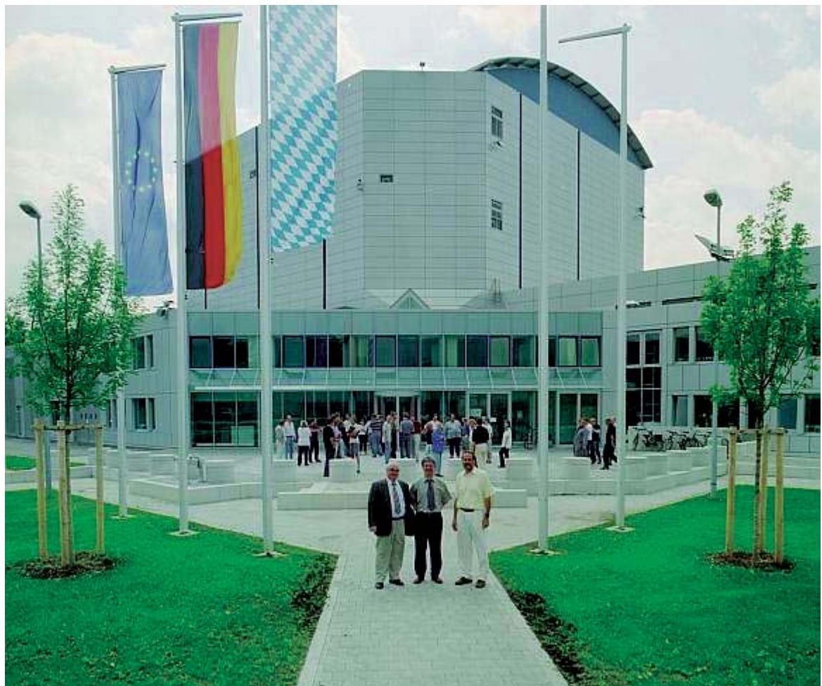
Entrance of the FRM II at Garching near Munich – the destination for the RRFM 2004 technical tour.