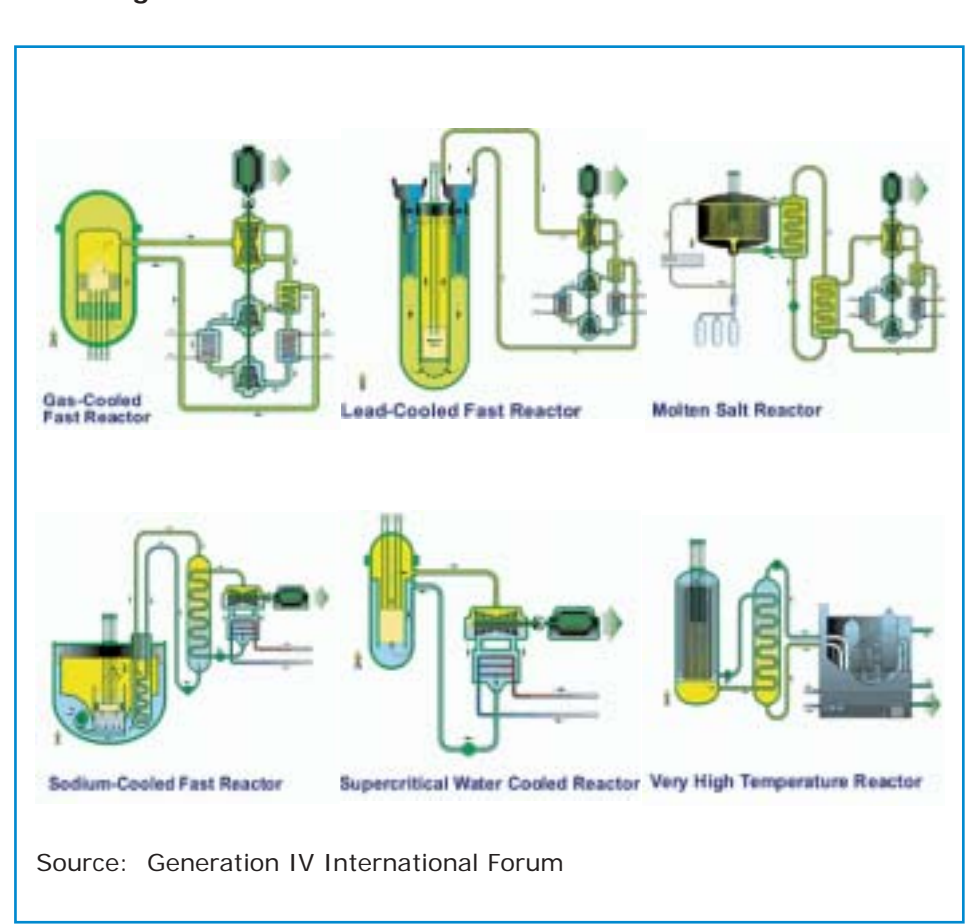
Figures 2-7: The 6 GenIV Families

If nuclear energy is to supply a share of the world's primary energy which is significantly larger than the